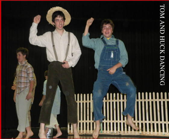
TOM AND HUCK DANCING